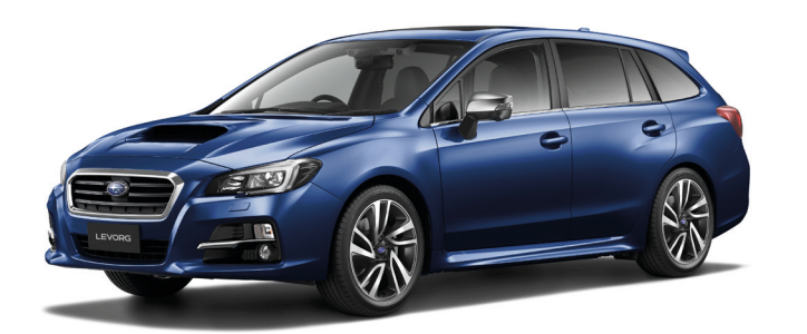
LAPIS BLUE PEARL