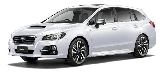
CRYSTAL WHITE PEARL