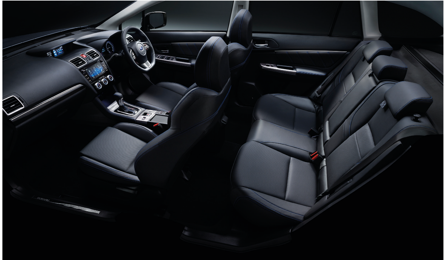
Black leather upholstery with blue stitching