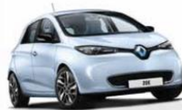
ICEBERG BLUE (3) RPH