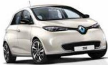
CALICO GREY (2) KNV