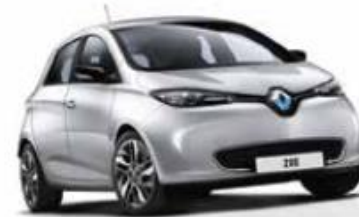
NEPTUNE GREY (2) KNR