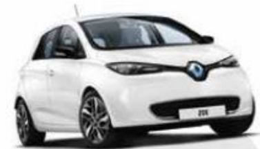
ARCTIC WHITE (4) QNC