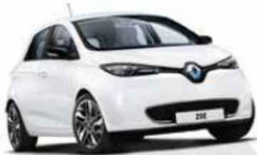
GLACIER WHITE (1) 369