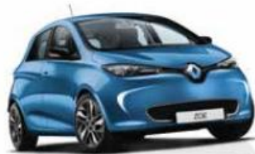
ZIRCON BLUE (2) RQG