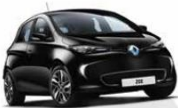
DIAMOND BLACK (2) GNE